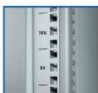
Mounting Pole w/screen UH