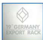
Front Door w/logo