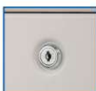
Security Cam Locks