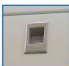
Slide Latch w/logo